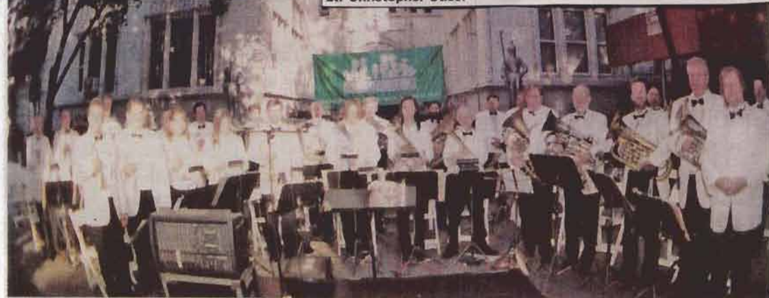
The Gramercy Brass Orchestra