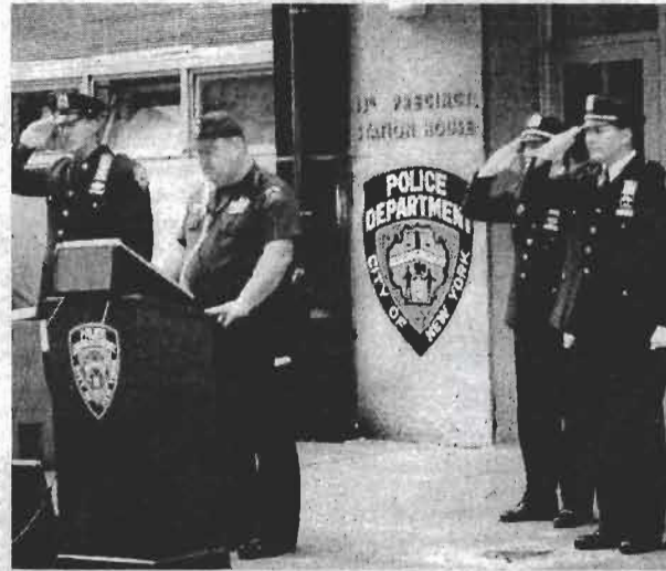
OFFICERS OF THE 13TH PRECINCT

Following the ceremony memorial in the precinct, many officers attended a very emotional and touching memorial service at the Epiphany Church on 2nd Avenue and 22nd Street, which